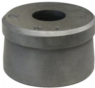
P737A Ø37.7mm Round Die - RDN2