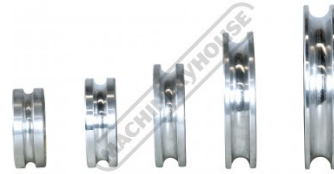
Round Formers Side View