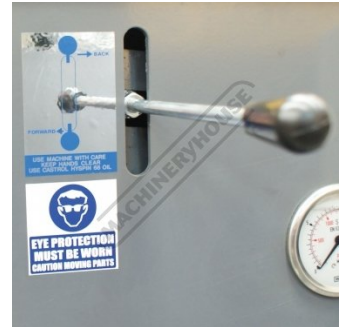
Ram Engagement Handle