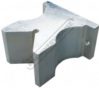
Comes with a 75mm and 105mm Former