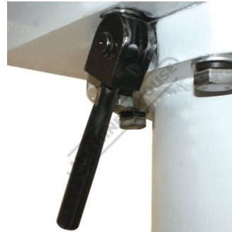
Head Locking Handle