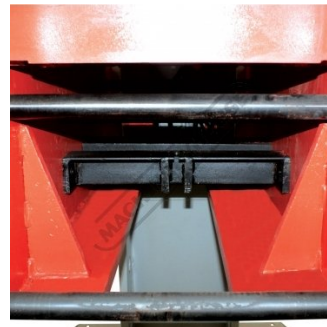
Table Height Lifting Points