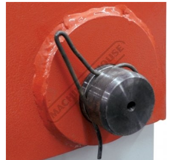
Pin Safety Clip