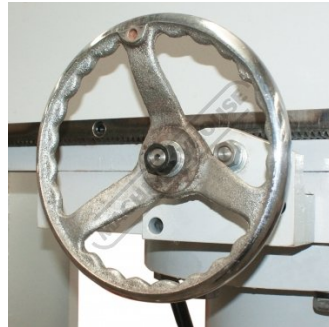
Head Movement Handle