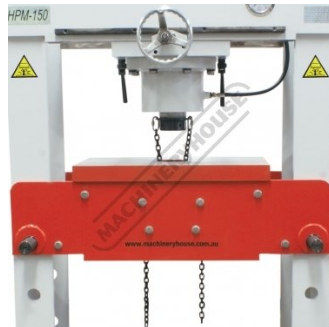
Table Height Adjustment Using Chain