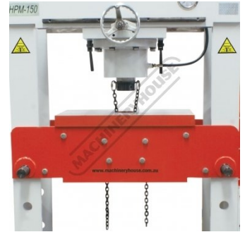
Table Height Adjustment Using Chain