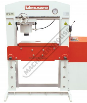
Front View Head Left Position