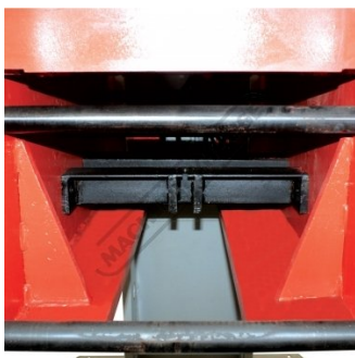
Table Height Lifting Points