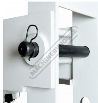
Head Height Positioning Pins