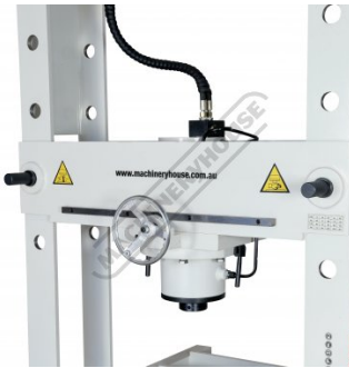
Cylinder Ram Head