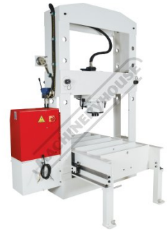
Rear Left View