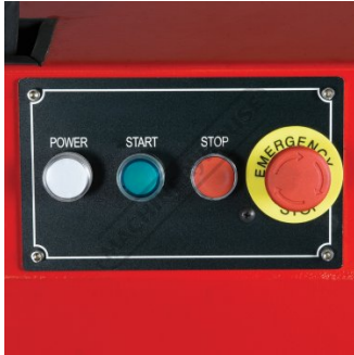
Power Control Panel