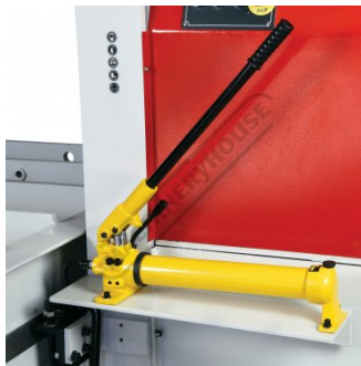
Hydraulic Press Position Lock