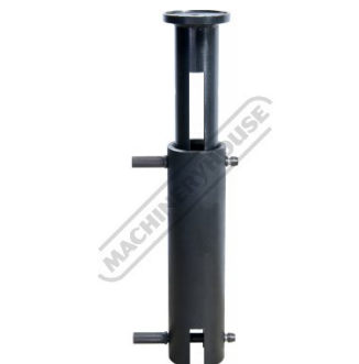
Adaptors For Raising-Lowering Ram