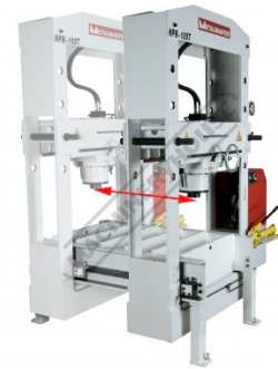
Horizontal Press Positioning