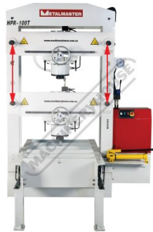
Adjustable Ram Head Height