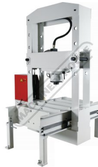
Rear Right View