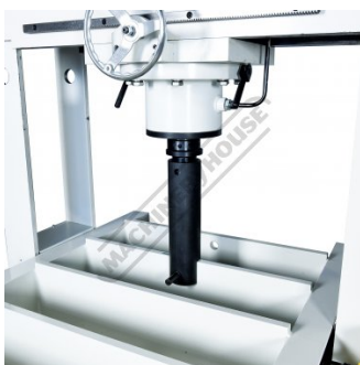
Ram Head Height Setting Adaptor