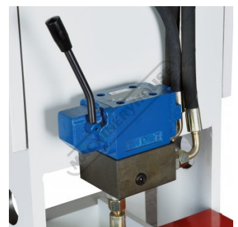
Hydraulic Pressure Lever Control