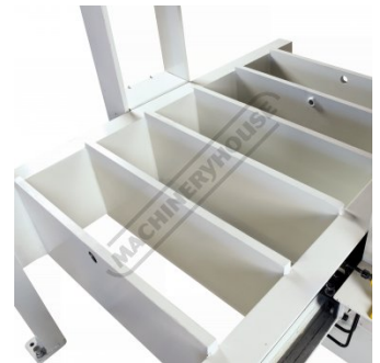
Bed Strengthening Rib Plates