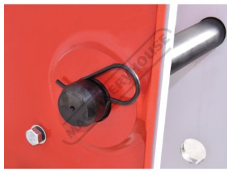
Pin Safety Clip