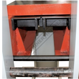
Table Height Adjustment Chain Slot