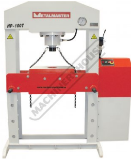
Table Height Adjustment With Chain