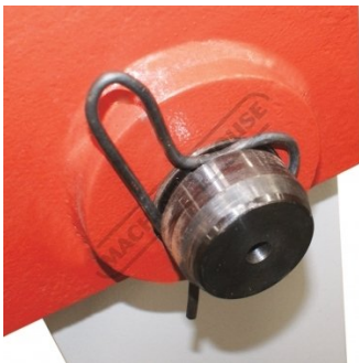
Pin Safety Clip