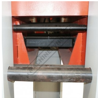
Table Chain Lifting Point