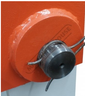
Pin Safety Clip