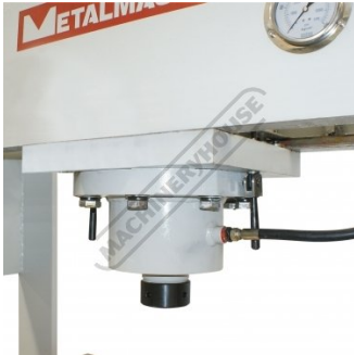
Sliding Ram Head Adjustment Handle