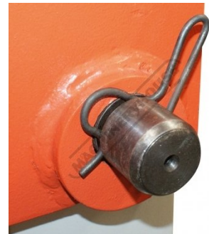
Pin Safety Clip