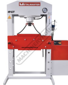
Table Height Adjustment Change