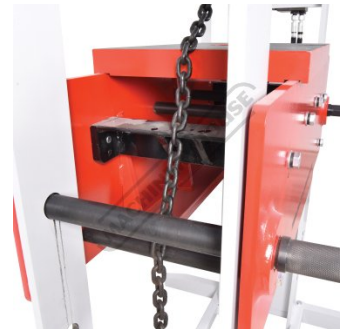
Table Height Adjustment Chain Slots