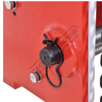
Pin Safety Clip