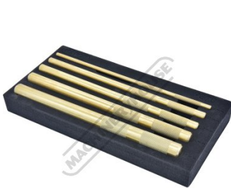
Set Shown in Foam Storage Holder