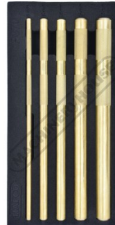
Foam Case Top View