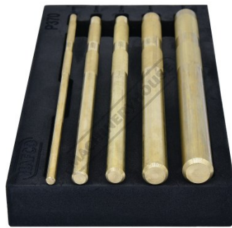
Foam Case End View