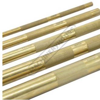
Textured Knurling for Enhanced Grip