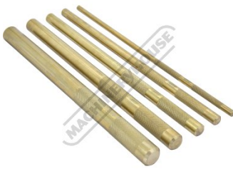
Top End View