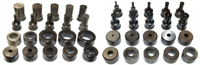
P165 Ø6-26mm Round Punch & Dies Set