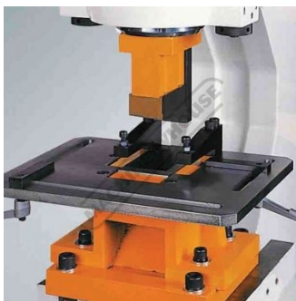
Optional Rectangular Notcher