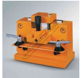
Optional Flat Bar Shearing