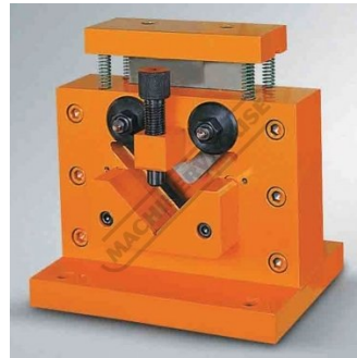
Optional Angle Shearing