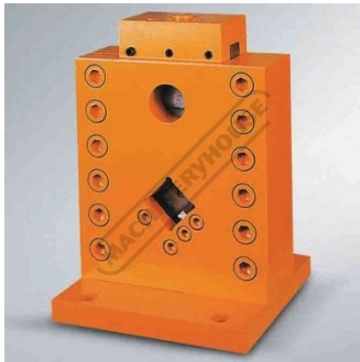
Optional Bar Shearing