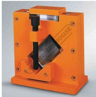
Optional Channel Shearing