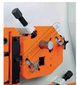
Round Bar Shear