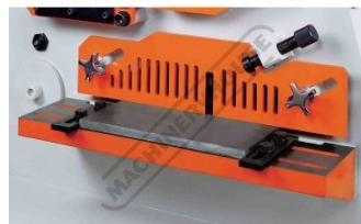
Flat Bar Shear