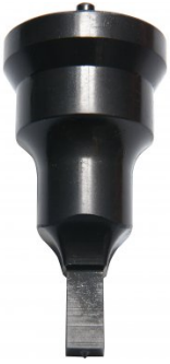
P6001 8 x 8mm Square Punch