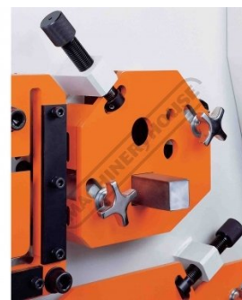
Square Bar Shear