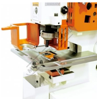
Work Table with Adj. Stops