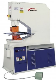
P194 Punching Machine