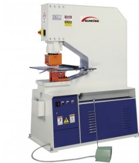
P194 Punching Machine