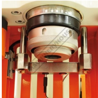
Fitted To Machine