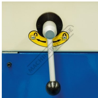
Main Post Release Lock Lever