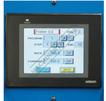
Touch Screen NC Control