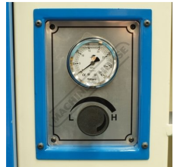
Pressure Adjustment Dial and Gauge