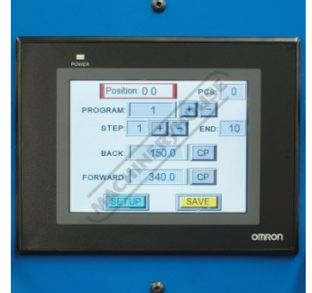
Touch Screen NC Control