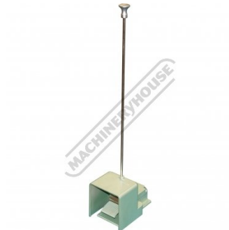
Roving Foot Pedal