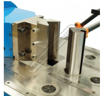
Hydraulic Horizontal Press