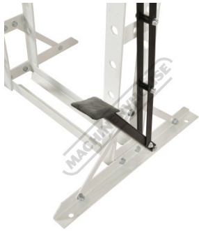
Hydraulic Foot Pump