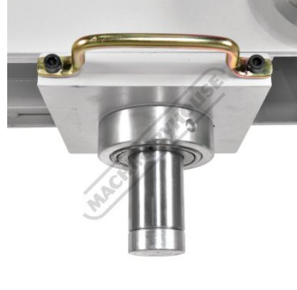
Ram & Handle