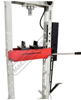
Hydraulic Hand Pump