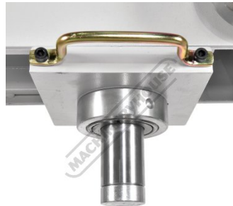
Ram & Handle