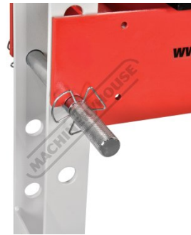
Table Pins with Safety Clip