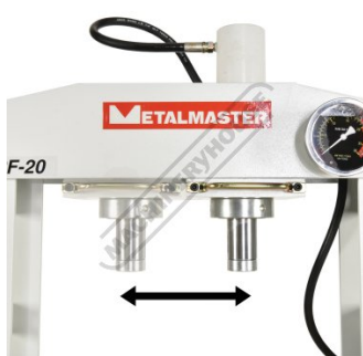
Horizontal Sliding Ram