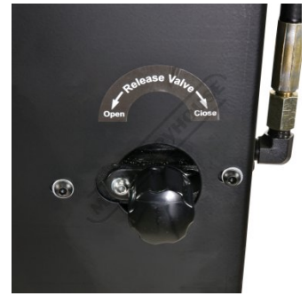
Hydraulic Pump Speed Control