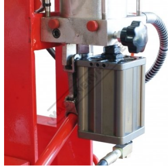
Hydraulic Release Handle