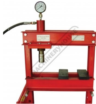
Ram Slide to the Left