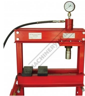
Ram Slide to the Right