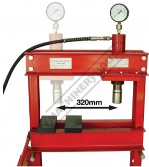
320mm Travel between Ram Centre