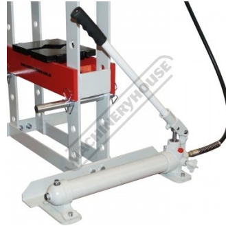
High Quality Hydraulics