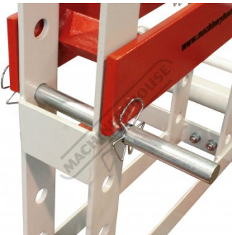
Table Pins With Safety Clips