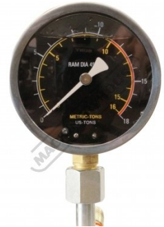
Metric / Imperial Pressure Gauge