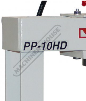
Robotic welded frame