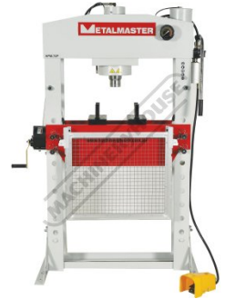
Shown in Down Position on Press