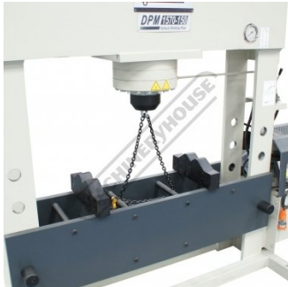
Table Height Adjustment