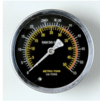
Metric / Imperial Pressure Gauge