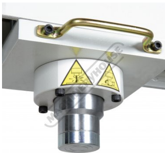
Sliding Ram With Handle