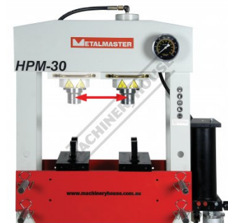
Horizontal Sliding Ram