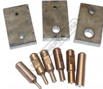
Punch Dies 3 10mm