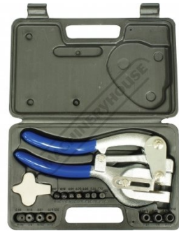
Shown in Case