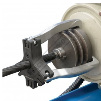
Action Shot 2