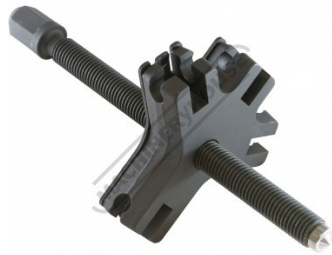
Combination 2 or 3 Jaw System