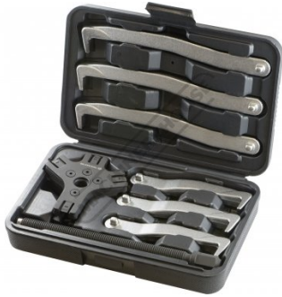
Supplied in Plastic Blow Mould Case