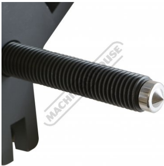
Self Aligning Centre Tip