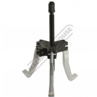
Short Leg Setup Internal Legs