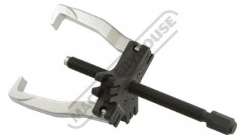
2 Leg Setup