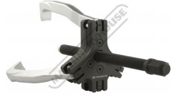
Short Leg Setup Rear View