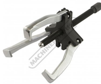
Short Leg Setup Front View