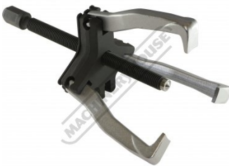
Short Leg Setup Front Left View