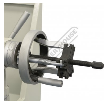
Action Shot Reverse Jaws 2