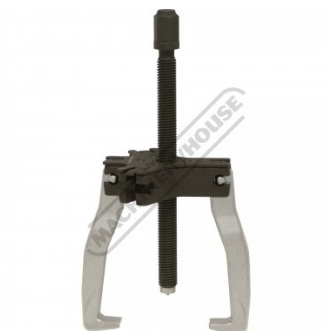
2 Leg Setup Vertical View