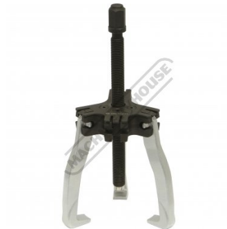
Short Leg Setup Vertical View