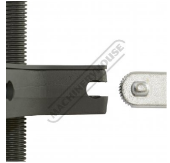
Click In Leg Design