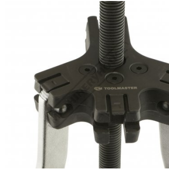
Ratchet Action Jaw Lock Alignment