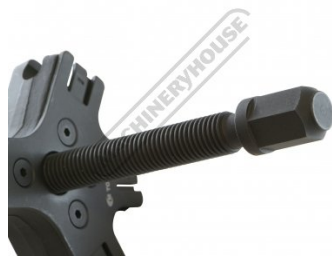
Hex Head Drive Extractor