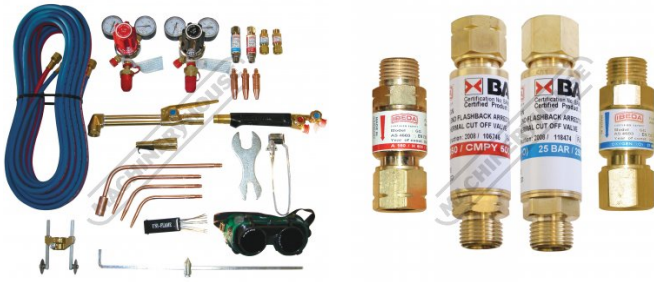
Oxygen Acetylene Gas Kit Contents Flash Back Arrestors