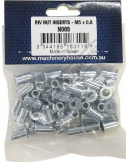
Packaging Rear Side