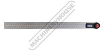
zero degree view