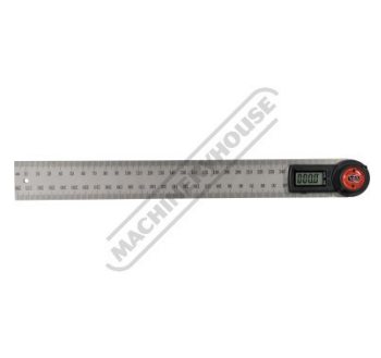
Zero Degree View