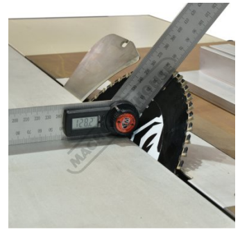
Shown Measuring Blade Angle