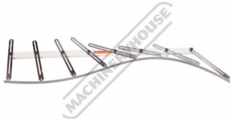
Shown with Concave & Convex Curves