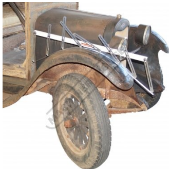
Shown On Truck Single Curve