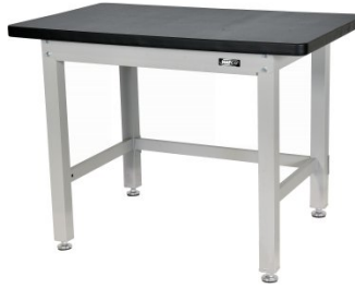
A415 Industrial Work Bench