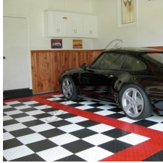
Garage Tiles Setup