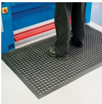
Shown Being Used with a Lathe