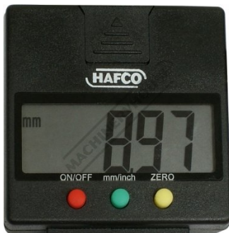
Digital Display Close Up