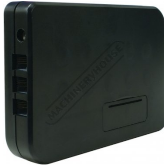
Left Rear View