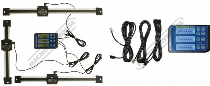
Shown With Optional Vertical and Horizontal Scales Set