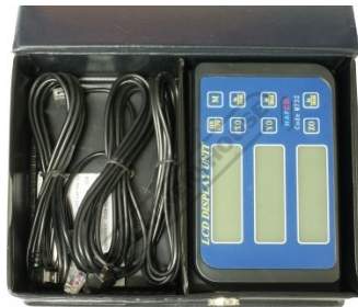
Case Top View