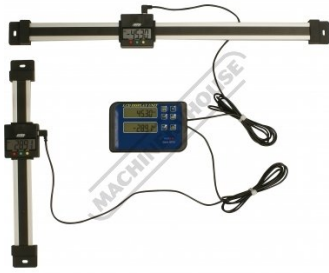
Shown With Optional Vertical and Horizontal Scales Set