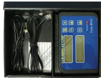
Case Top View