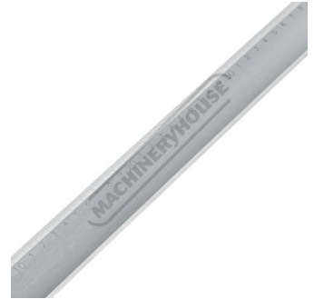
Clear Graduations Close Up 2