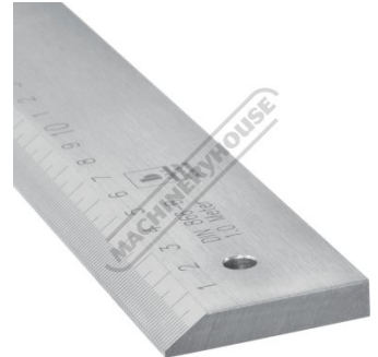
End Profile View