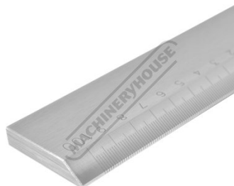
1000mm End View