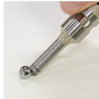
Spring Loaded Ø10mm Ball