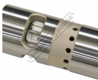
Red Light Illuminates & Audio Beep Sound Alerts for Deeper Holes