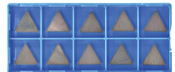
L066 KYOCERA Carbide Inserts - Milling