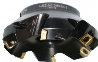
M518 Face Mill 45° - Super High-Rake