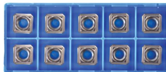
L065 KYOCERA Carbide Inserts - Milling