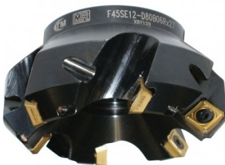
M517 Face Mill 45° - Super High-Rake