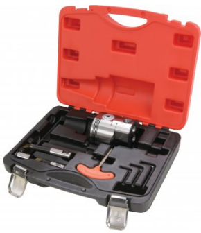
M184 Precision Boring Head