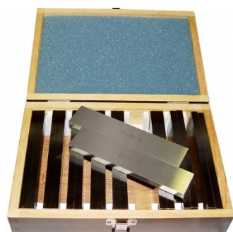
M252 Parallel Set - 18 Piece