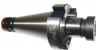
M552 Face Mill Arbor