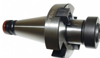
M554 Face Mill Arbor