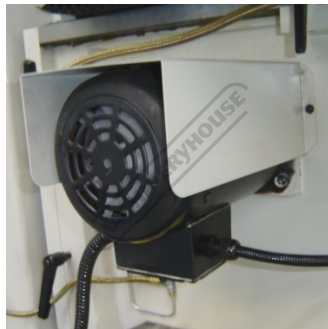
Knee Elevating Motor for Z Axis