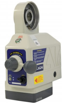
M2295 Power Feed Unit