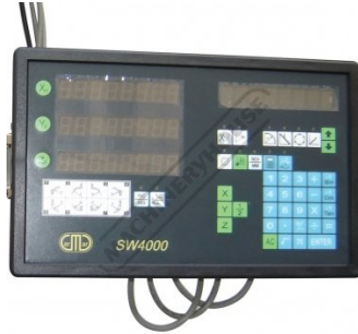
3 Axis Digital Read Out