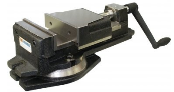
V106 Vertex K-Type Milling Vice