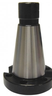
M197A Boring Head Shank