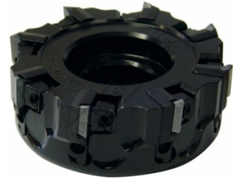
M503 Face Mill 90° - Positive Rake