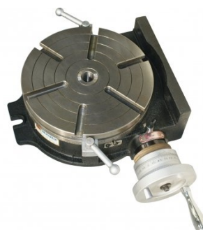
R010 Vertex Rotary Table