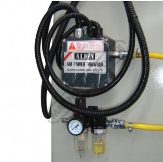
Align Air Operated Drawbar System