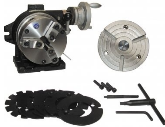
R002 Vertex Super Indexing Head