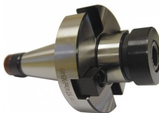
M555 Face Mill Arbor