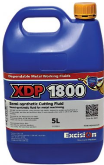
S090 Soluble Metal Cutting Fluid - 5 Litre