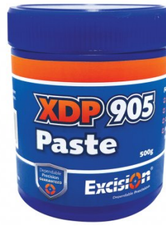
S074 Cutting Tool Lubricant Paste - 500g