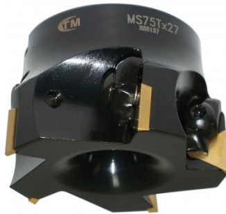
M512 Face Mill 90° - Positive Rake