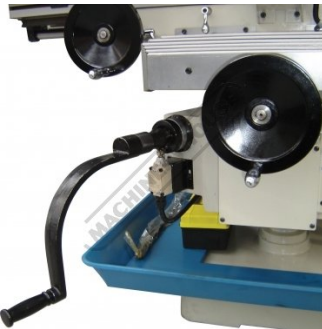
Safety Micro Switch On Z Axis Lever