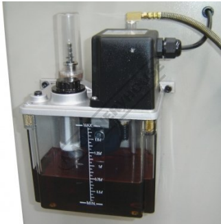
Auto Lubrication System