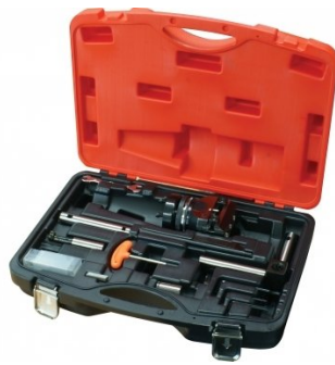
M185 Precision Universal Facing & Boring Head