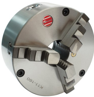
C2806 3 Jaw Self Centring Lathe Chuck