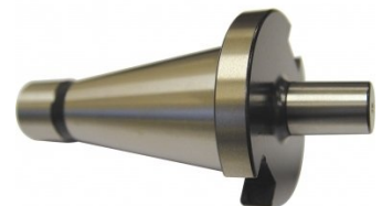
D446 NT40 x JT6 Drill Chuck Arbor - M16 Threaded Shank