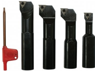
M181A Boring Bar Set - 4 piece