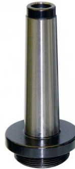
M192 Boring Head Shank