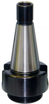
M193 Boring Head Shank