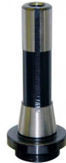
M190 Boring Head Shank