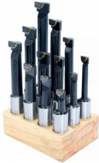
M181 Boring Bar Set - 12 piece