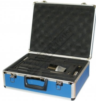
Case Shown Open