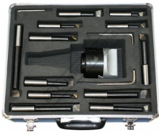
Top View in Case