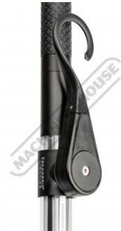
Shown Clipped On To Light