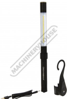
Shown With Accessories