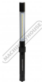
Line Light R Hand Light