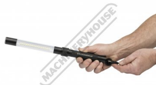
Connecting The USB Charging Cable