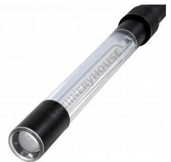
Top LED Tube Light