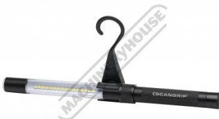
Shown with Magnetic Hook