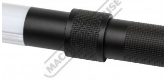
Rotating Switch to Activate Light Bar & Spot Light