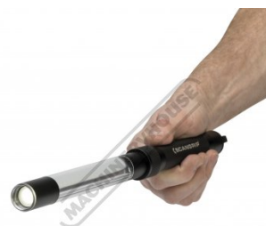
Hand Held LED Light