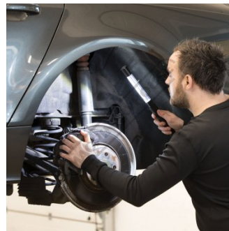
Shown In Use Automotive Industry