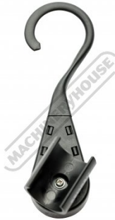
Clip On Swivel Hook & Magnetic Back