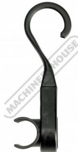
Clip On Hook & Magnetic Back