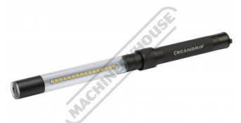
Line Light R Hand Light