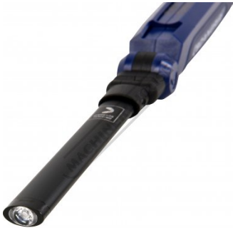
9mm LED Spot Light