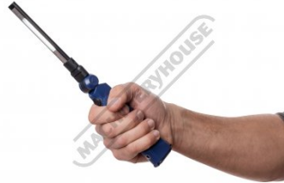
Shown Arm Extended in Hand