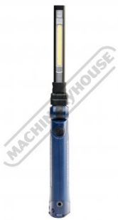
Main Light Front View