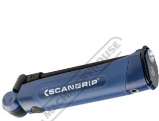
Folded Light Arm