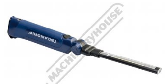
Slim Hand Light