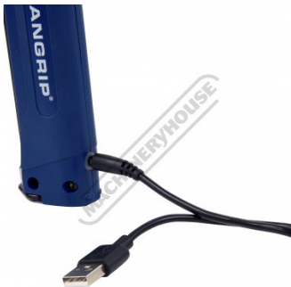
USB Charging Cable