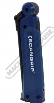
Folded Light Arm