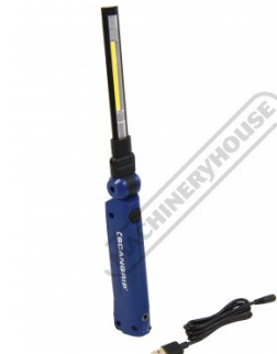
LED Light And Charger