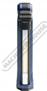
Folded Light Arm