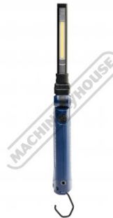
Magnetic Base & Hook Attachment