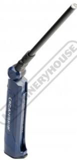
Swivel Light Arm