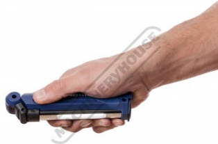
Shown Folded in Hand