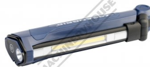
Folded Light Arm