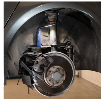
Shown in Use - Automotive Industry