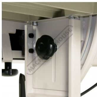
Table Height Locking Knob