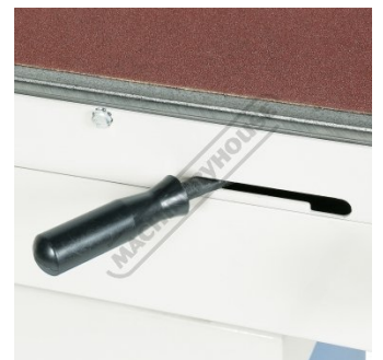
Quick Action Belt Tension Lever