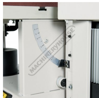
Tilting Table Scale