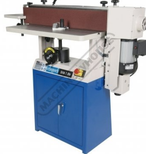
Right Rear View