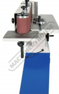
End Table View