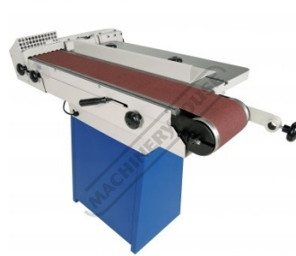
Table Guide Support