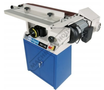
Table Guide Support Rear View