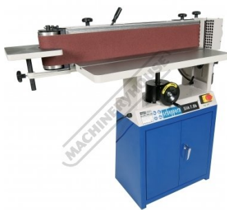
Table Height Lowest Position