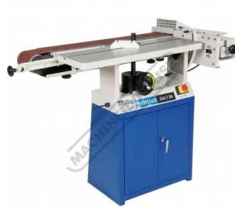
Horizontal Sanding Belt Position