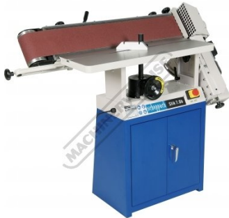
Tilting Sanding Belt 90-180 Degrees