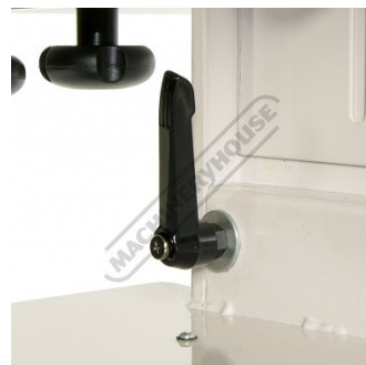
Belt Angle Tilt Lever Lock