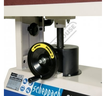
Table Height Adjustment Handle