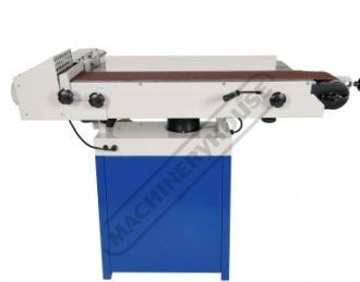
Side View of Belt